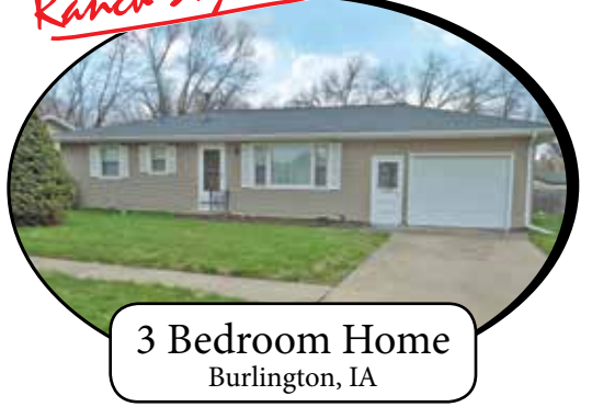
3 Bedroom Home Burlington, IA