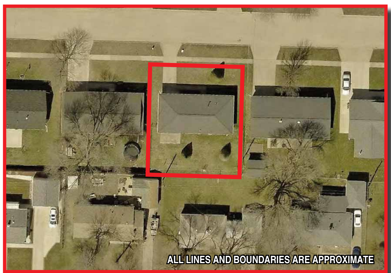
ALL LINES AND BOUNDARIES ARE APPROXIMATE